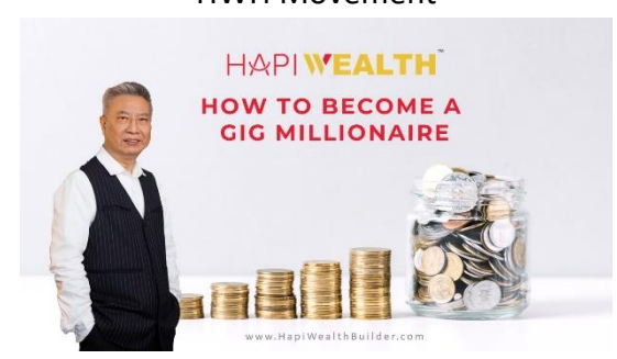
How to become a Gig Millionaire