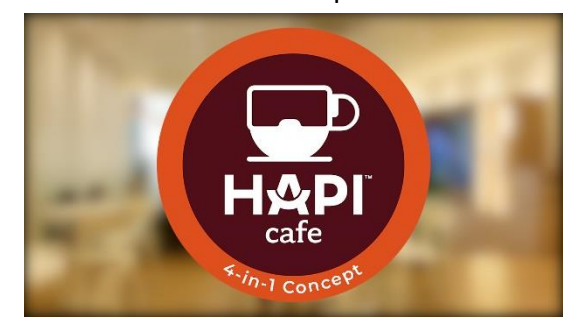
HAPI Café Singapore