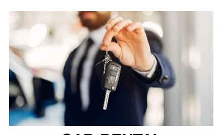
CAR RENTAL Save on car rentals!