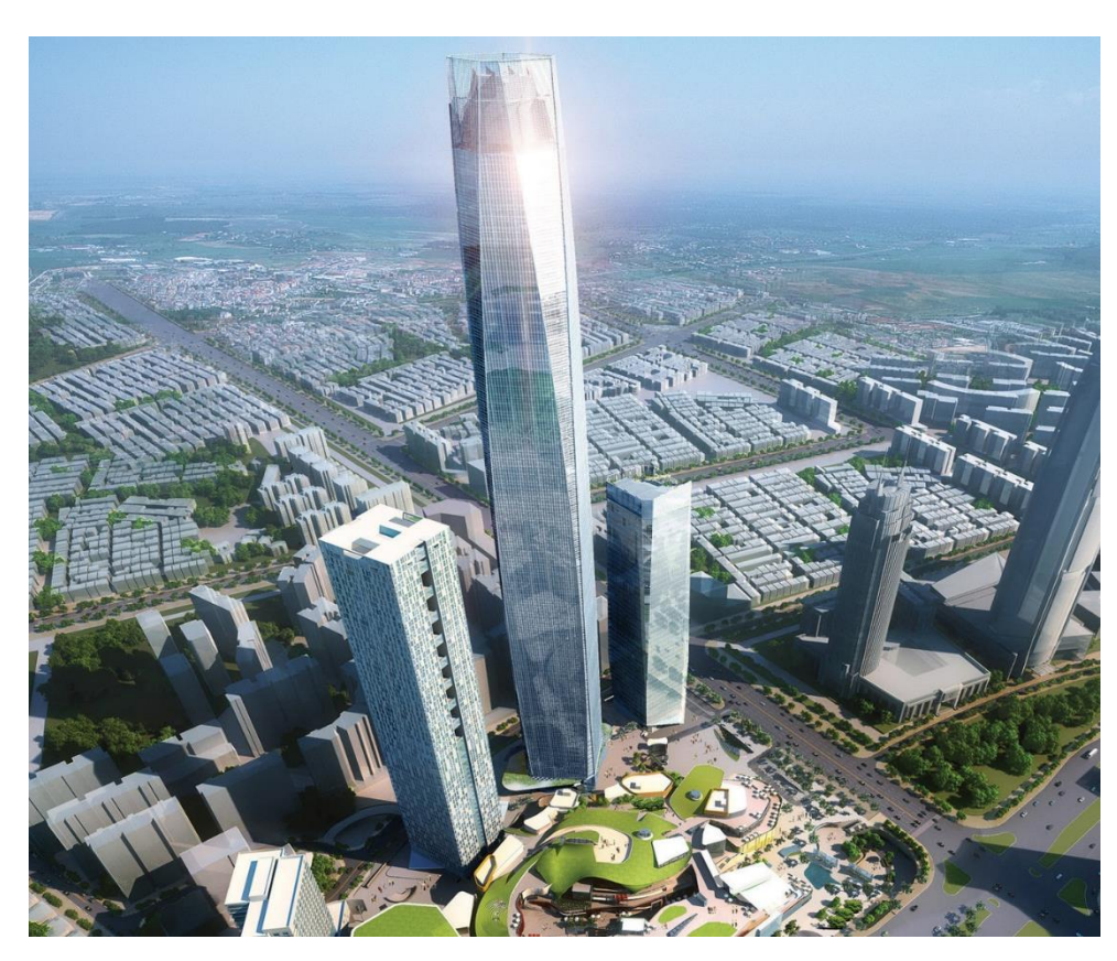
Tallest Building in Dongguan - 68 Floors Global Economic and Trade Building