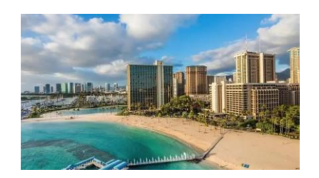
RESORT Access to unlimited resort vacation getaways