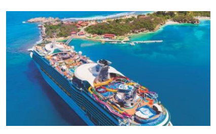
CRUISE Get cruise discounts the best online prices.